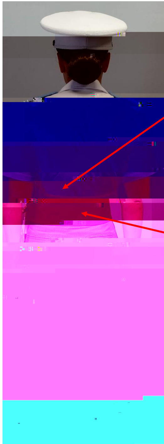
Summer Leave, Under Arms with Sword