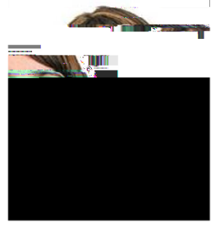
Bohbairent bair cannot touch BOTTOM of uniform collar in the back air can be pinned back from face or loose.