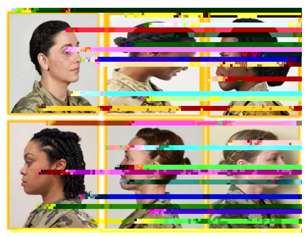
Futnacia in Nov Cacet Uniform